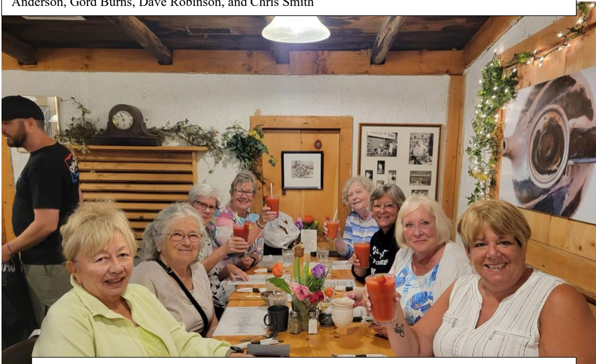
The gals enjoying lunch while their spouses/partners attended and suffered through the AGM meeting.