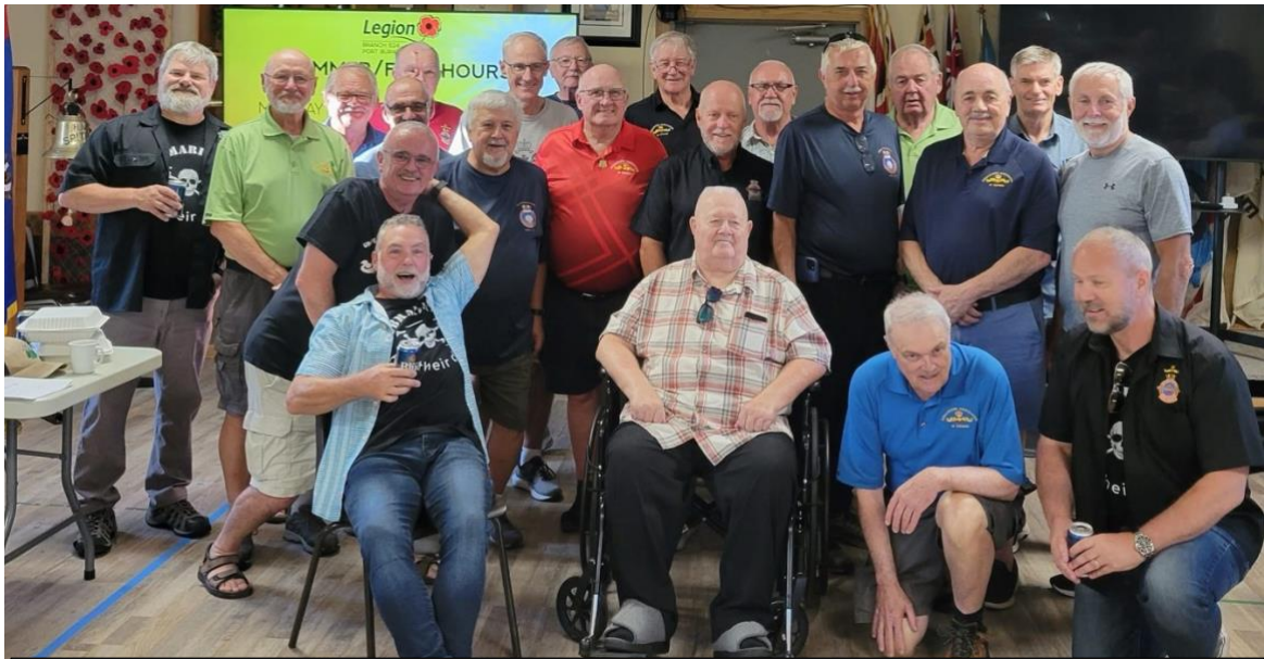
2025 SAOC Central AGM Attendees – A cast of pirates for sure!