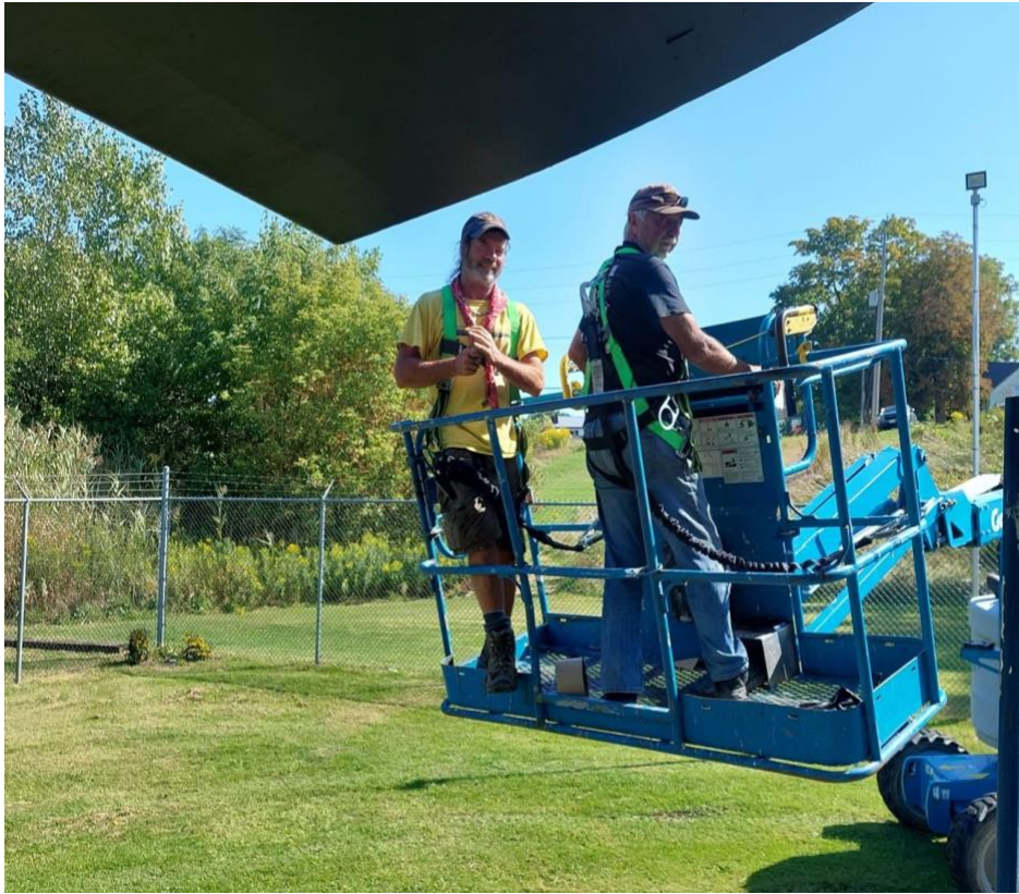
Ojibwa Sep 2025 work period volunteers