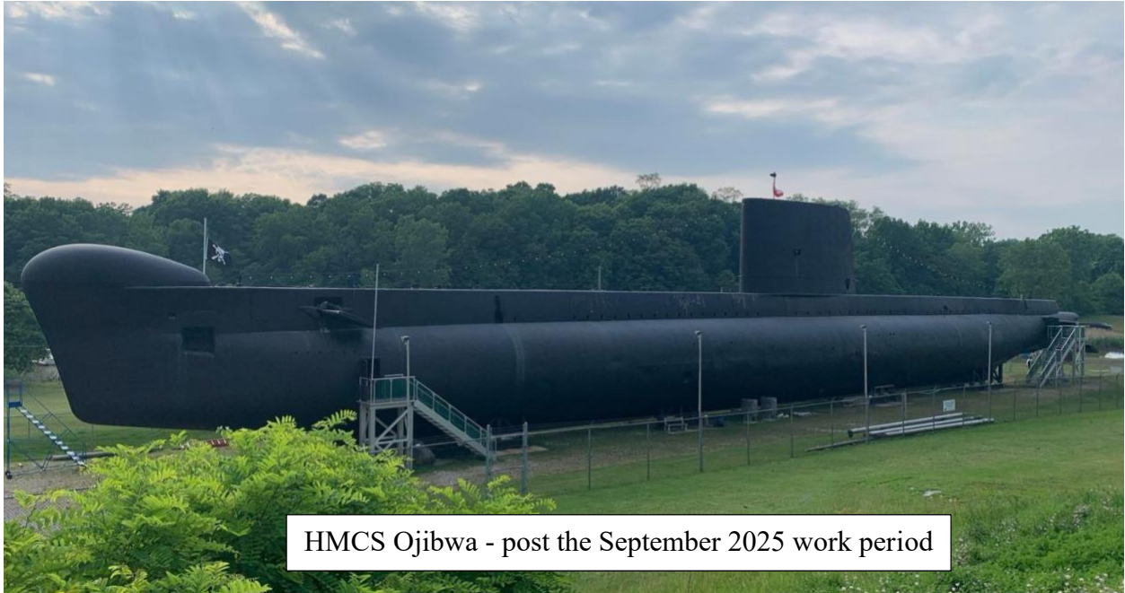
HMCS Ojibwa - post the September 2025 work period